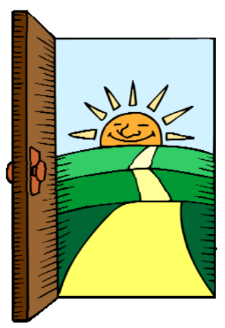
Open a new door.

MRT has proven to be a successful self-help program. Testimonials of graduates report that as a result of MRT, they are able to better communicate their feelings and emotions and are able to repair and build more meaningful relationships. The program is built around the concept of making intelligent choices.